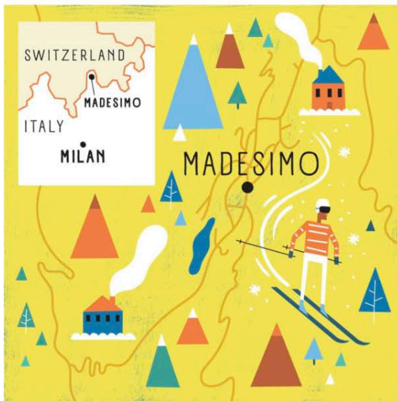
ILLUSTRATION: SHAW NIELSEN

An Italian industrialist built a family retreat in the resort town of Madesimo, a small town in the Italian Alps that is about a 2½-hour drive from Milan. Key to the design is a spalike space off the master bedroom to serve as an antidote to body aches after a long day on the slopes.